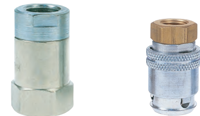
328 LOCK-ON AIR CHUCK (SHORT) Chuck locks on valve when cocked on threads. Has greater air flow and seat cannot be blown out if seal fails. Has 1/4" NPT female thread.