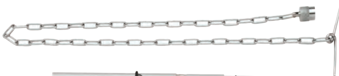
CH-425 SCREW ON AIR CHUCK Screws onto large bore valves. Designed for aviation inflation. Has 1/4" NPT female thread. Maximum working pressure up to 300 psi.