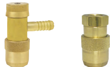
H-4660A CLIP-ON AIR CHUCK Securely locks onto valve when sleeve is pushed forward, releases when sleeve is pulled back. Has 1/4" NPT female thread.