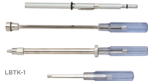
LBTK-1 — LARGE BORE TOOL KIT Kit contains the 5131, TL-690, H-4660A, N-1910, GA-255S-RCL, 8909-C, N-1710, and N-1810.

SAFETY! THESE PRODUCTS, AS WELL AS ALL TIRE TOOLS, SHOULD NEVER BE USED BY PERSONS UNLESS THEY HAVE BEEN TRAINED PROPERLY ACCORDING TO OSHA REGULATION #29CFR 1910.177 ENTITLED "SERVICING SINGLE-PIECE & MULTI-PIECE RIM WHEELS."